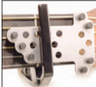
A at the first fret capo clip partially behind the nut