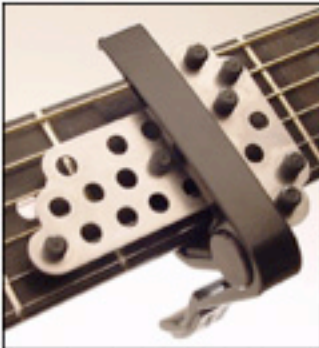
Jazzy sounding Dominant 7th 13 suspended by inverting metal frame