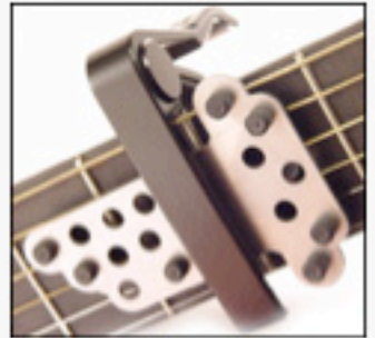
Minor Chord, 2nd position minor shape